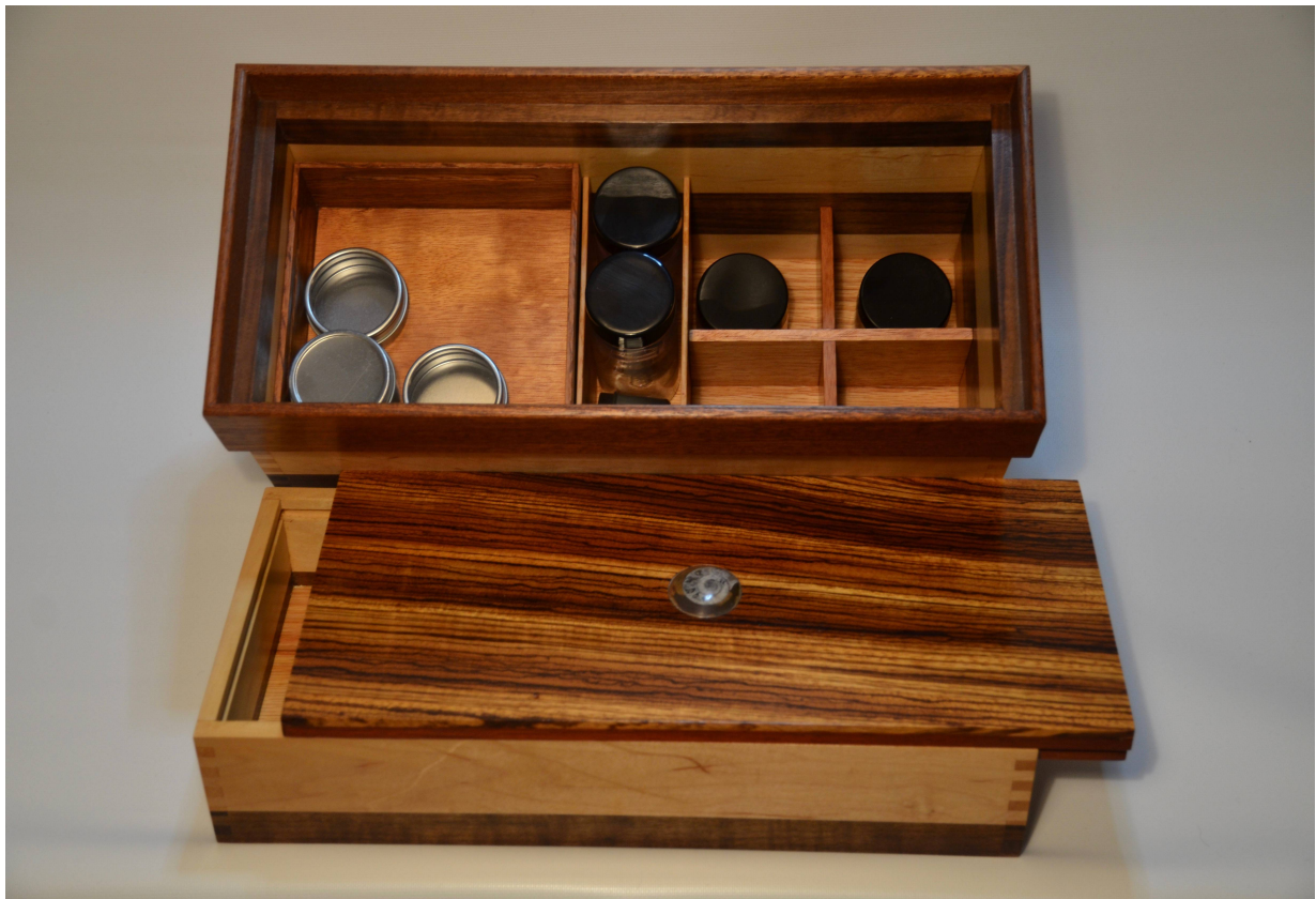
Collectors Box by Marc Blouin