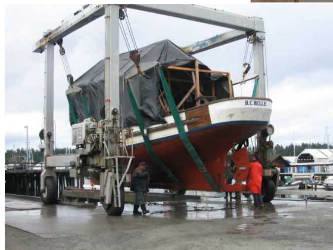
GETTING READY FOR MORE WORK