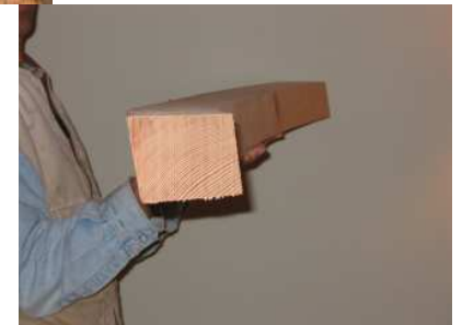
REPLACEMENT PARTS (New Bullworks) IN FIR